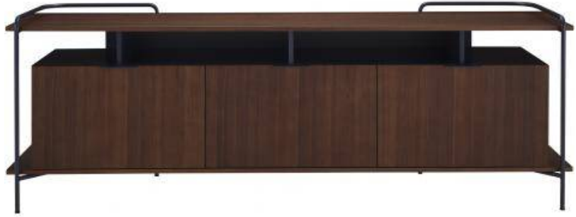
SIDEBOARD 3 FLAP DOORS LOW FEET

The sideboard is also available in a version with 2 flap doors and a block of 4 drawers in the centre, with or without the tubular base.