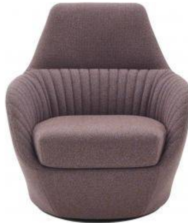
ARMCHAIR COMPLETE ITEM