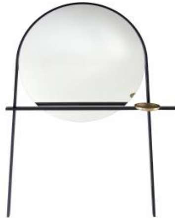
MIRROR / CLOTHES STAND