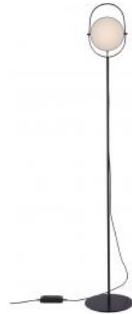
WALL LIGHT RED