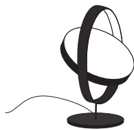
table lamp black