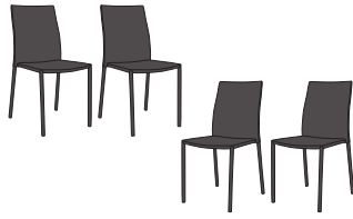
pack of 4 chairs black leather

H 885 - mm W 445 - mm D 550 - mm SH 455 - mm