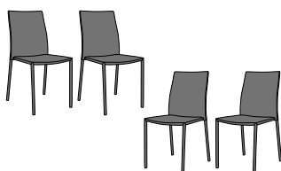
pack of 4 chairs grey leather

H 885 - mm W 445 - mm D 550 - mm SH 455 - mm