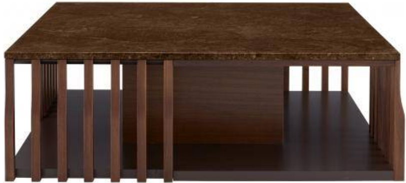
LOW TABLE DARK WALNUT VERDE MARBLE TOP

The lower space is free of any partitioning with only the central square consolidating the whole and supporting the weight of the heavy marble top (67 kg): this brings the table's overall weight to 121 kg, although it does not look as if it is that heavy. The central square is also finished in dark walnut veneer, with the lower top in contrasting chocolat lacquer. The low table is mounted on adjustable jacks which lift it 20 mm from the ground.