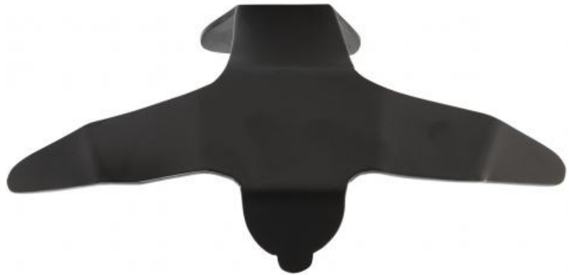
1 HOOK UP BLACK